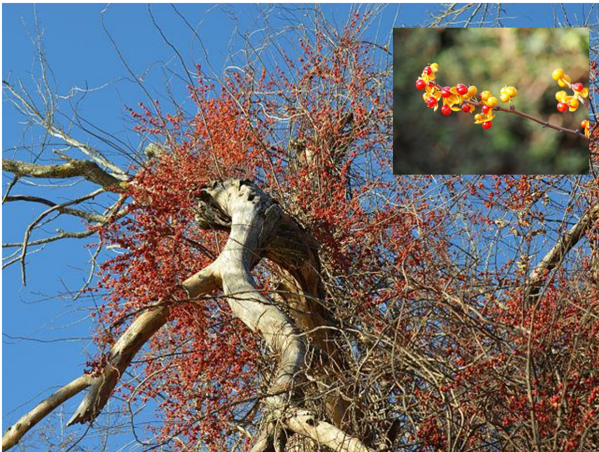
Oriental Bittersweet vines