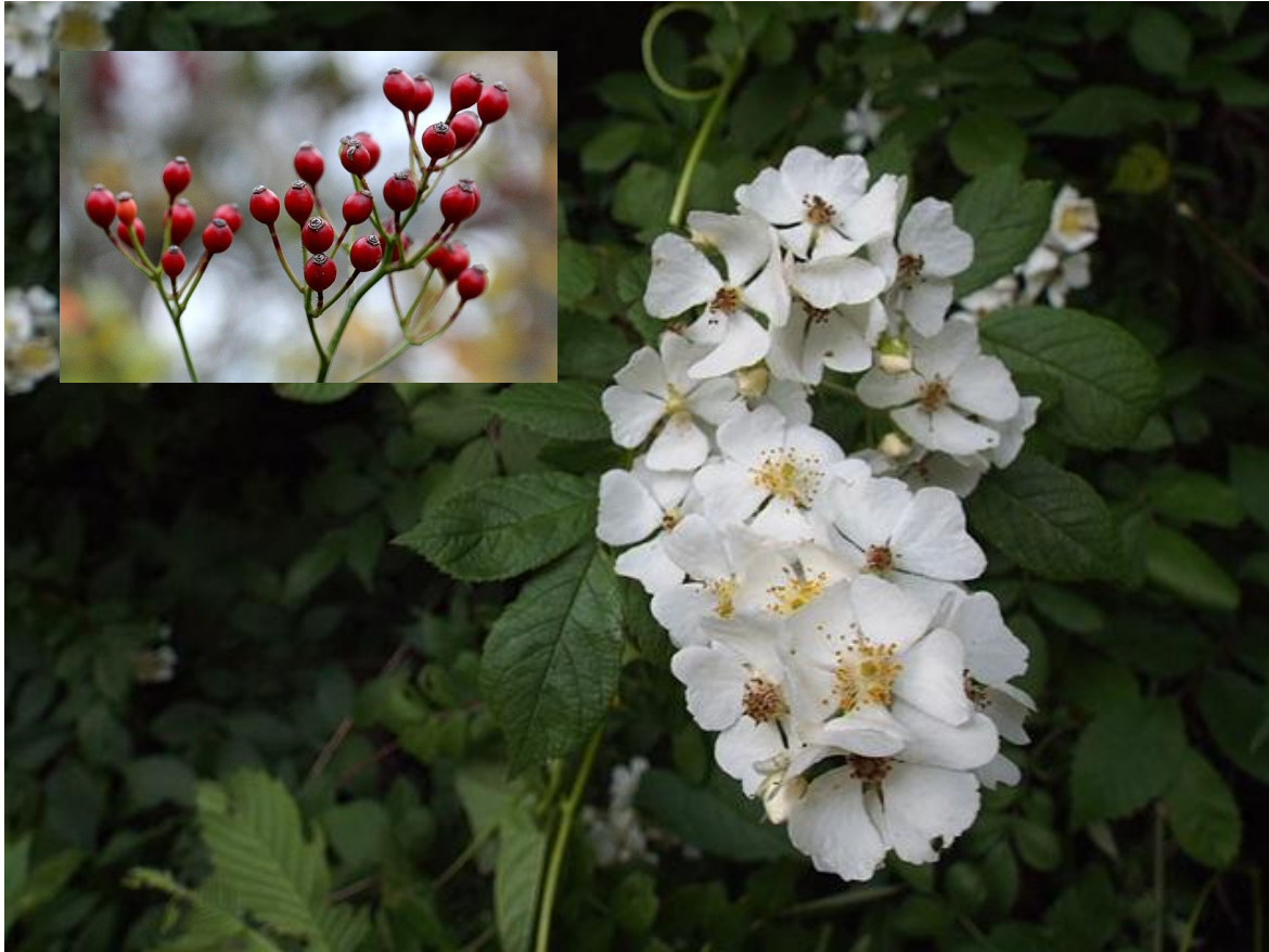
Japanese Multiflora Rose