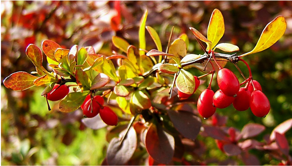
Japanese Barberry Wikipedia – Photo by Wildfeure