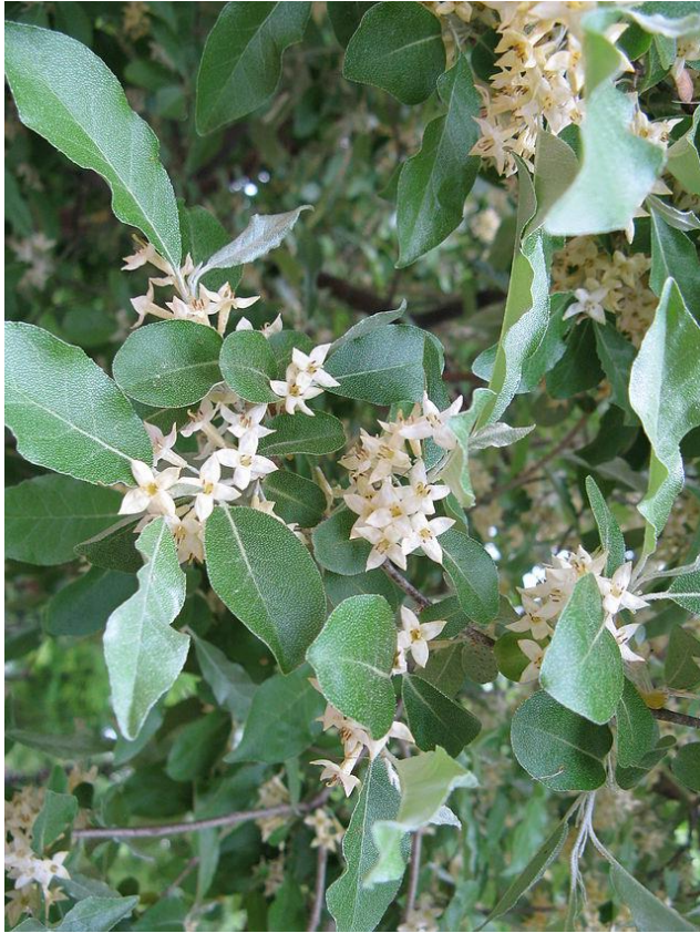
Autumn Olive Wikipedia